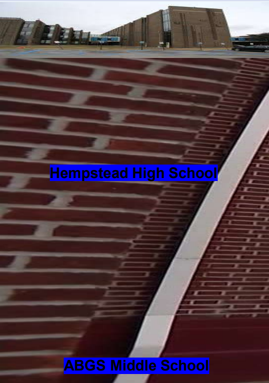
Hempstead High School