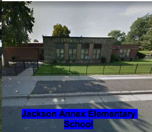
Jackson Annex Elementary School