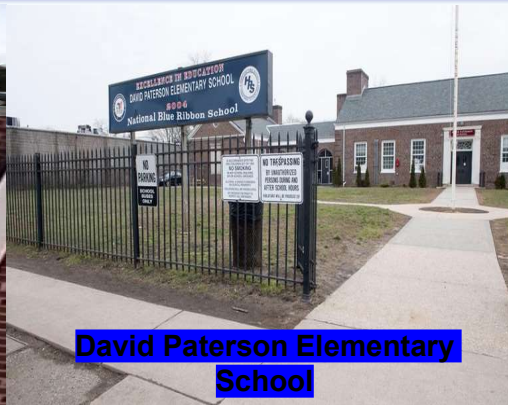
David Paterson Elementary School