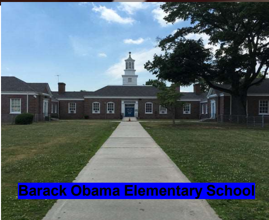
Barack Obama Elementary School