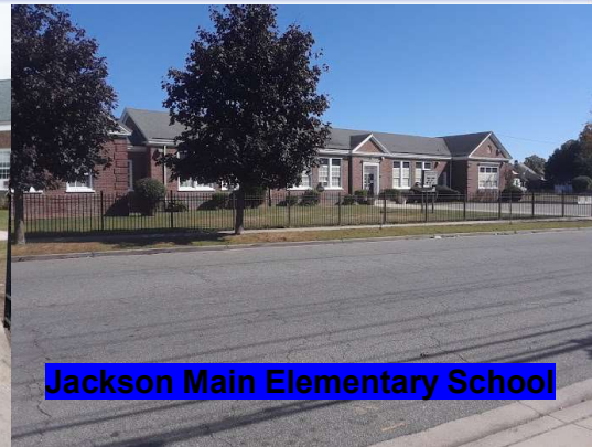
Jackson Main Elementary School