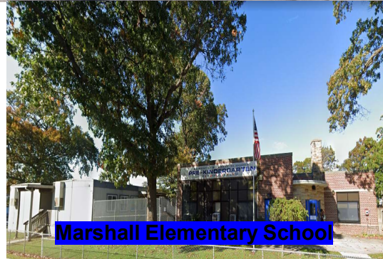
Marshall Elementary School