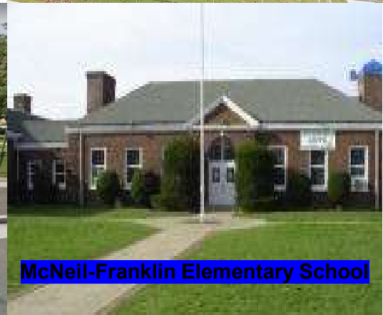
McNeil-Franklin Elementary School